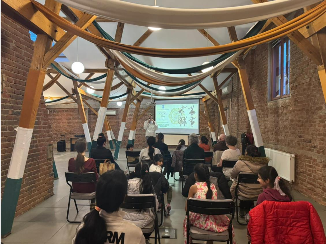
Remarks by Brahmakumari, announcing the commencement of meditation classes in the Embassy premises